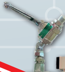
Colour metering valve with automatic stroke adjustment