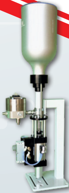
Colour supply pump with metering control