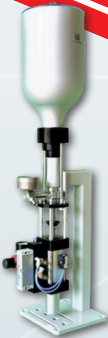
10 l colour supply pump