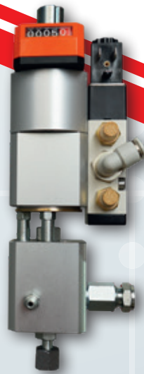
Colour metering valve